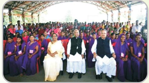
Interaction with Woman SHG's of Kadaknath farming, Mini Rice Mil, Mushroom e-Rickshaw and phoolsundari group