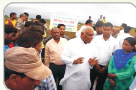
Plantation of Fruit plants at KVK Mungeli, Farm by Shri Punnulal Mohile, Hon'ble Minister of Food and Civil Supply, Consumer Protection, Planning, Govt. of Chhattisgarh