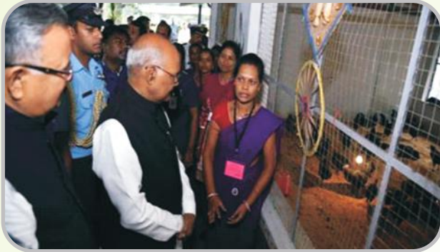
Interaction with members of Kadaknath farming Woman SHG's at Kadaknath poultry Farm

Farming, Goatry Farming, Mini Rice Mill, Mushroom Production etc. In this Farm total 8 kadaknath poultry farm ,1 Dairy, 1 Goatry, 2 Mini Rice mill, 1 Mushroom Unit, 1 Duck cum Fish Farming unit and 15 acre mixed fruit plantation established by KVK Dantewada (C.G.) through DMF Fund.